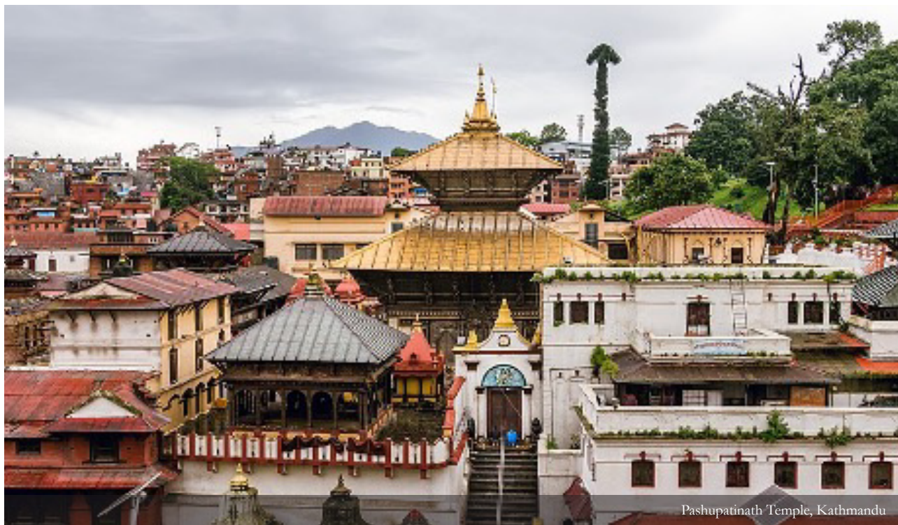
Pashupatinath Temple, Kathmandu