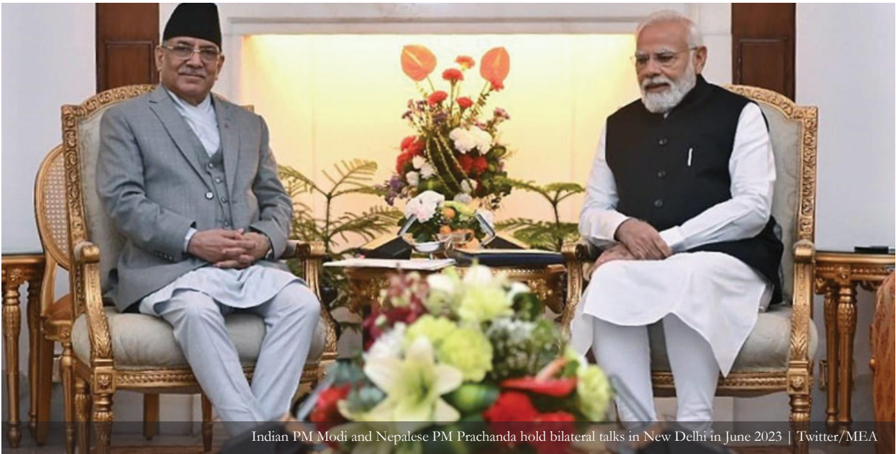
Indian PM Modi and Nepalese PM Prachanda hold bilateral talks in New Delhi in June 2023